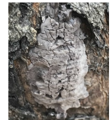
Egg mass on bark

Shiny Grey to dull grey brown Hard to the touch