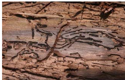
Twig beetle galleries associated with thousand cankers disease (photo by Whitney Cranshaw, courtesy of Bugwood Network).