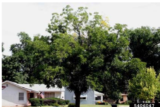
Early canopy symptoms of thousand cankers disease.

Despite the graphic name of this disease, cankers are not the most obvious symptom. Initial symptoms of infection may be subtle. Leaves may flush in spring, but then suddenly wilt. Gradually the upper branches die back. Cankers are hidden beneath the bark and can only be seen in the early stages of disease when a thin layer of bark is cut away. A dark brown stain is apparent in the phloem just beneath the outer bark. The discoloration does not extend into the xylem (the wood), so care should be taken to