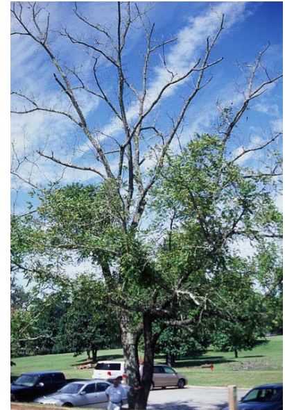
Later stage of thousand cankers disease.

Thousand cankers disease was first identified in 2001 in infected black walnut trees in Colorado; however, mortality in black walnut stands was observed in Oregon in the presence of twig beetles as far back as the 1990's, so the disease was likely present earlier than 2001. Both the beetle and the fungal pathogen are thought to be native to North America, so the epidemics that occurred in black walnut at that time were not due to an introduced species. On the contrary, the epidemic in black walnut is thought to be due to an expansion of the twig beetle's host range, which followed the introduction of the black walnut, an eastern species, to western states. Previously, Arizona walnut ( Juglans major ) was the main host of the twig beetle and the canker disease did not occur on this host species. The discovery of thousand cankers disease in black walnut in Colorado raised the strong risk that the disease and its vector could be introduced to the native range of the black walnut east of the Mississippi. Such an introduction could easily occur through transport of infected walnut products, especially infected logs or firewood. The lack of resistance in the native population of black walnut could mean rapid spread of the disease in the eastern forest.