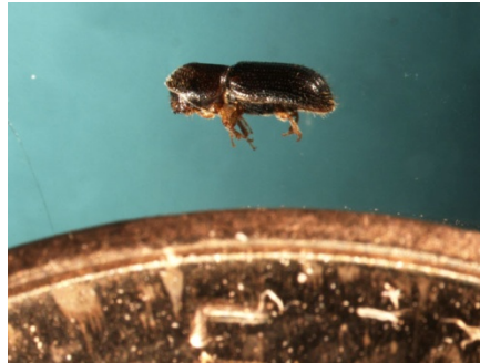
The walnut twig beetle, Pityophthorus juglandis.