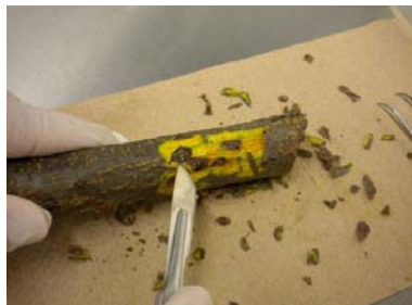
Cankers caused by the fungus Geosmithia morbida.