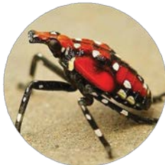
Developed nymph July-Sept.