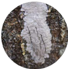
Egg mass Sept.-June