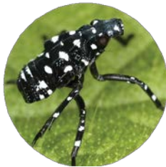
Hatched nymph April-July