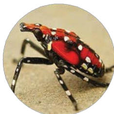
Developed nymph July-Sept.