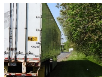
Do not park or store items near trees or bushes.