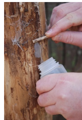
Scrape off life stages into a container.

Be sure to use a herbicide when removing Tree of Heaven. It is a very strong stump and root sprouter. Details for treating Tree of Heaven with a herbicide can be found in this publication http://www.dof.virginia.gov/infopubs/Control-and-Utilization-of-Tree-of-Heaven-2019-03_pub.pdf .